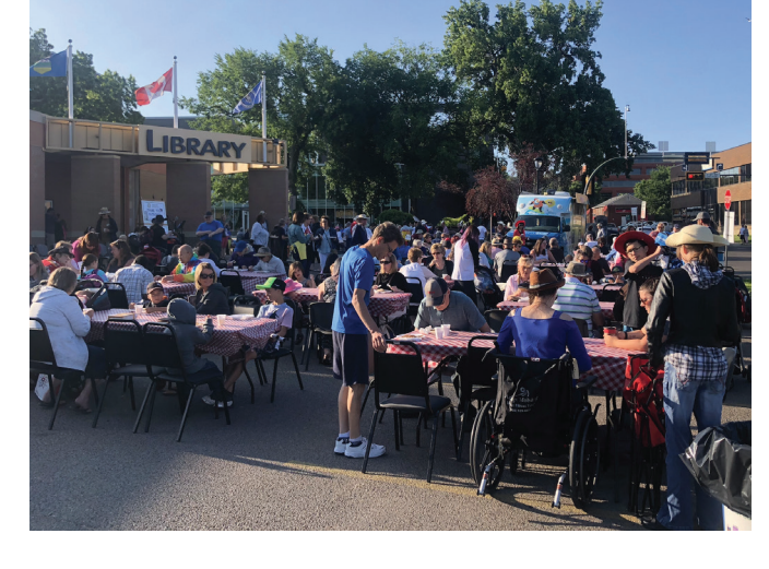
19 outreach events with almost 4,804 people reached