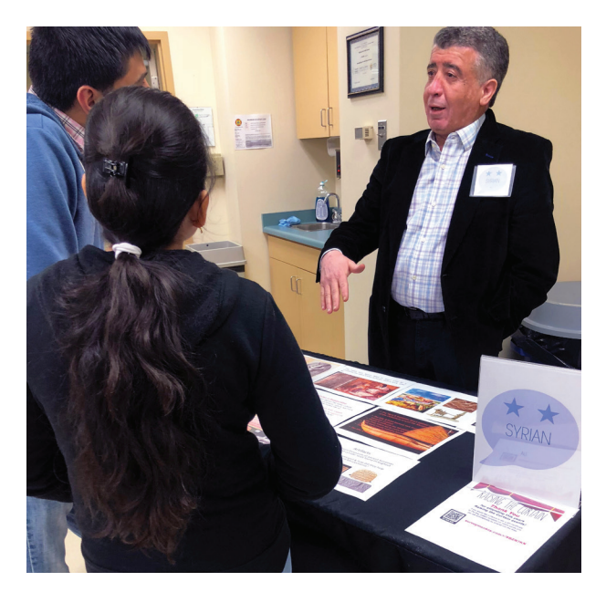
30 human books 44 check outs