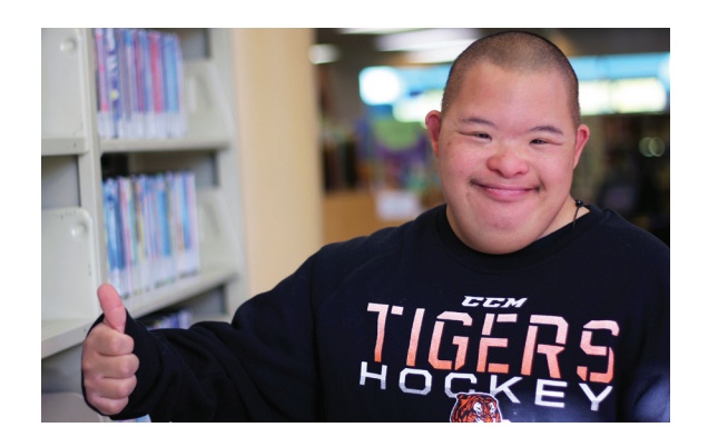
28,586 questions asked at the Info Desk