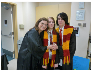
Tic-Tac Harry Potter Night