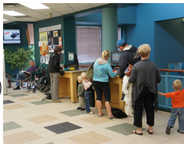
Using the Self-Checkouts