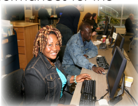
Using the computers

MHPL out and about with a table at three Farmers' Markets and a booth at the Country in the City exhibit during the Stampede.