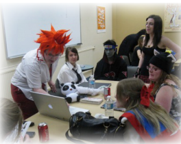
Tic-Tac Anime Night

After a rough patch when our primary access from First Street was completely blocked by construction, we celebrated the return to normal with our second Food for Fines drive, forgiving $165.10 in fines and delivering 594 items and $23 dollars in donations to the Food Bank.