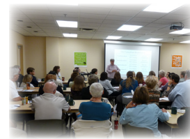
Staff Development Day

Great Summer Reading Program with 90 additional programs reaching 1715 participants. The Sunrise Rotary Ride the Road to Reading reached 1414 grade four children and 96 adults. Share a Story brought excited grand parents into the library to read a story book and be recorded on DVD for distant grand kids.