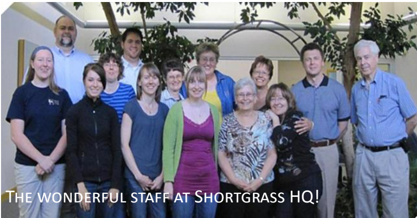
THE WONDERFUL STAFF AT SHORTGRASS HQ!

Pictured back row — left to right, front row — left to right.