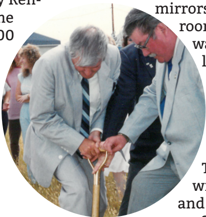
It's a big job, but at least we're not starting from scratch again!

With a new roof (including a large rooftop solar panel installation) added in 2015 and new flooring throughout most of the building in 2016, we will now be able to tackle some of the functional