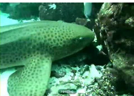
A resting Leopard Shark

Beyond its size, this aquarium is also unique "because it is open to the elements. This means the many thousand reef organisms that are housed there receive natural day and moonlight and experience rain and storm events like natural reefs do."