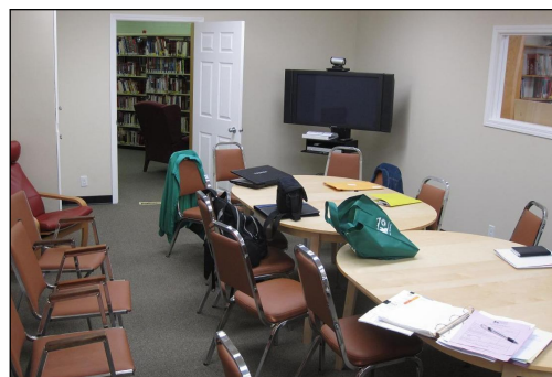
The meeting room looking north toward the adult collection