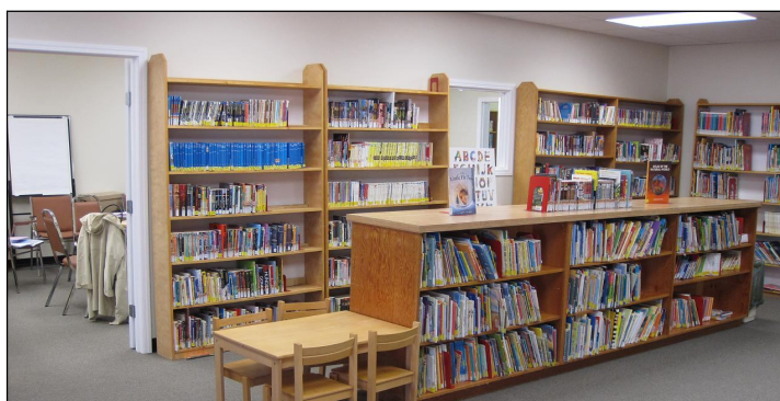
The new children's area looking west as patrons come in the front door