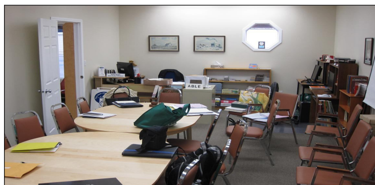
The meeting room looking south toward the front of the Bassano Memorial Library