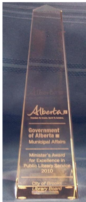
The Ministerial Award for Excellence in Public Library Service 2010

The award was one of five granted for either excellence in service delivery (doing something traditional in the best way) or innovation in service delivery (doing something new, or doing it in a new way).